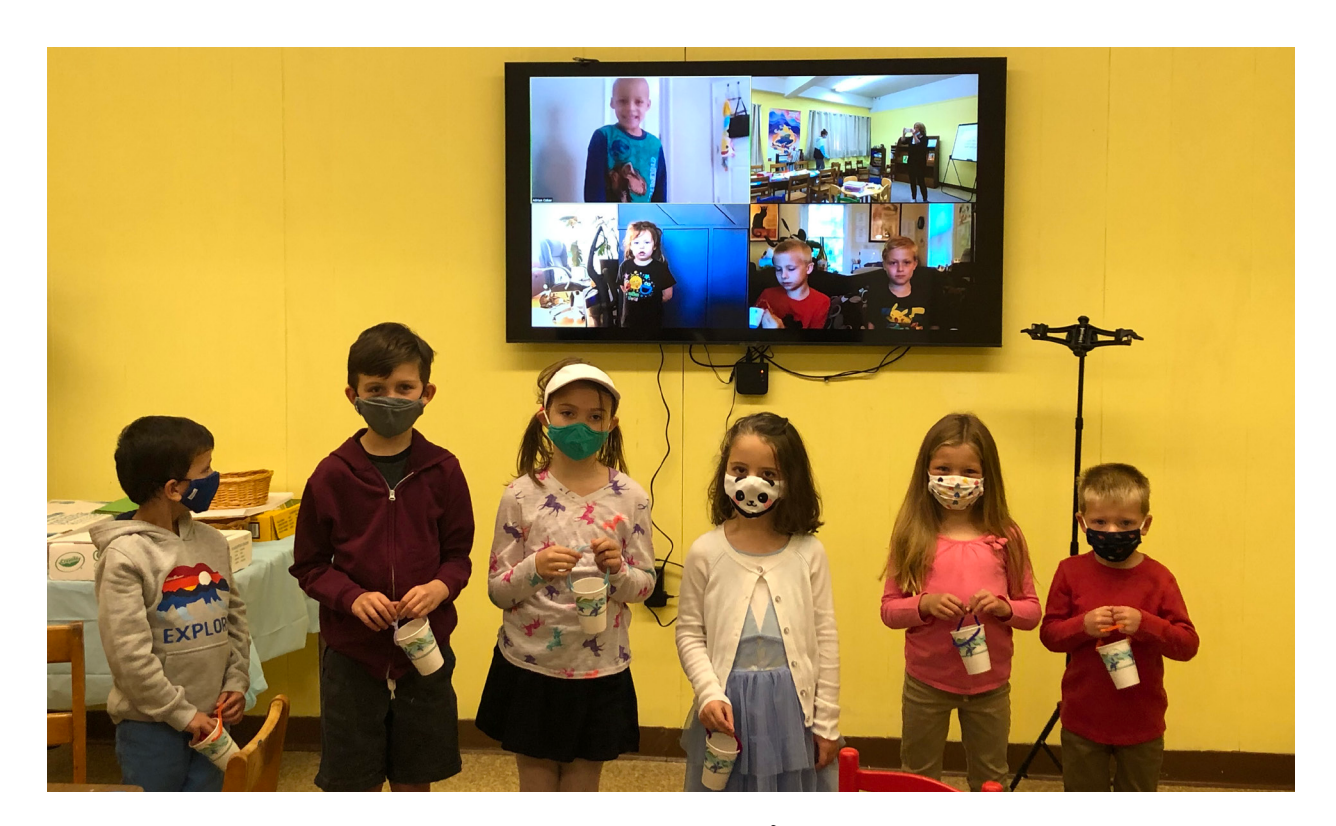
YOUTH & CHILDREN'S MINISTRY